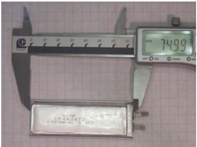
Authenticate the photo on original report only