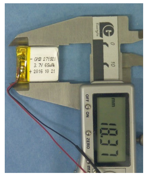
Authenticate the photo on original report only