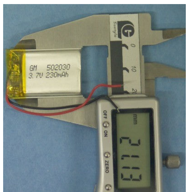
Authenticate the photo on original report only